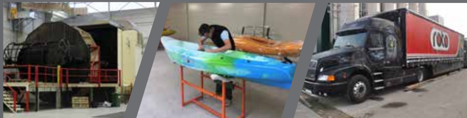
39 rotational moulding machines Assembling Distribution