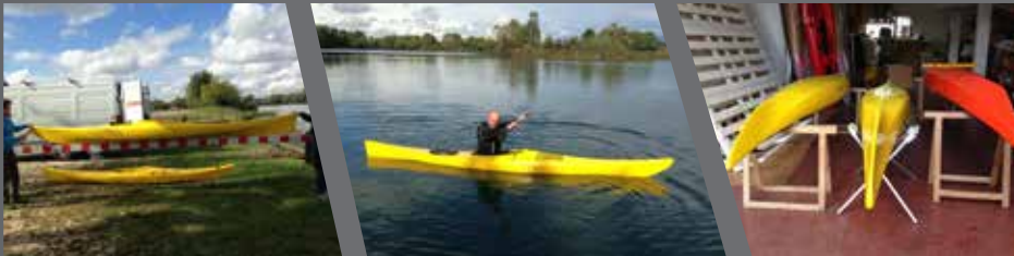
Prototyping Hydrodynamic and bouyancy test Hull finishing