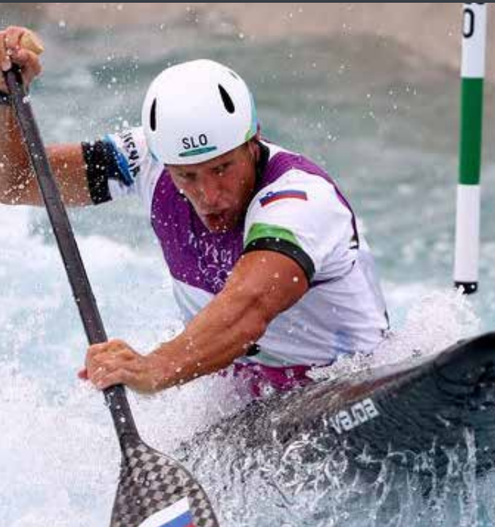
Benjamin Savšek golden medal at Olympic Games, Tokyo 2021