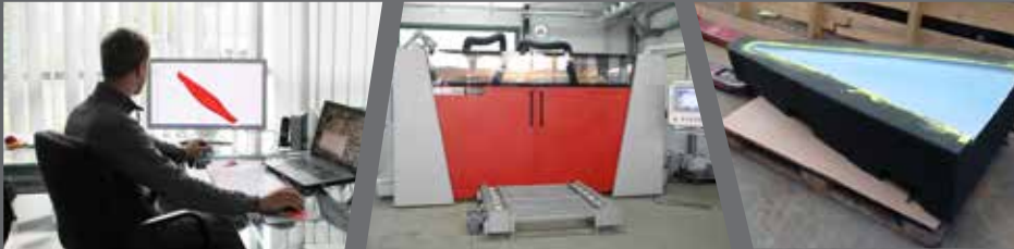
Computer drawing, simulation 3D printing Form for AI casting